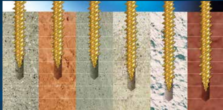
Suggested minimum screw-in depths